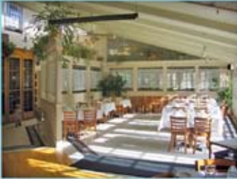
Elegant yet casual atmosphere