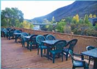
Our huge deck offers spectacular views